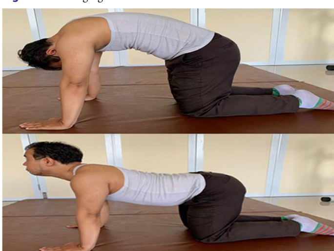
Figure 2. Cat & camel exercise