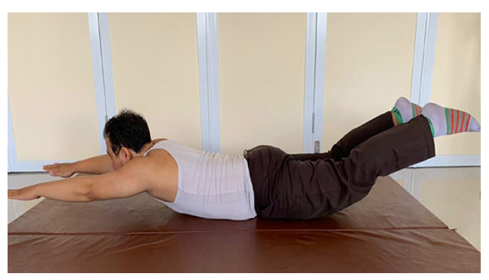
Figure 6. Superman