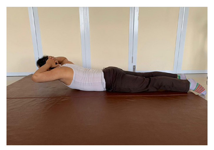
Figure 5. Raising head and shoulder off the ground

In the first week of evaluation, the patient reported his pain intensity was reduced but increased to the same level as on the first visit on the second week of evaluation. By then, a comprehensive reevaluation was performed by the physical therapist, which found the patient had non-ergonomic work habits (overloads and improper liftings). Therefore, the physical therapist gave the ergonomic intervention in addition to the physical therapy program three sessions per week during a five-weeks, including 15 mins stretching (Figure 7) (minimum 20s for four times reps to each stretching) and 15 mins lifting technique (Figure 8).9 Moreover, the physical therapist informed the patient to use the assistive tools (such as trolley or chart trolley) to carry heavy loads.