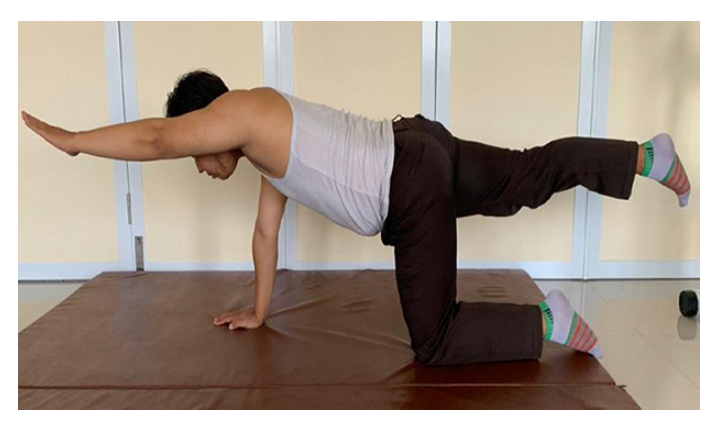
Figure 4. Bird dog exercise